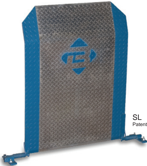
SL Patent No. D633,684

Ideal for route delivery systems like those found in beverage, bakery and snack distribution.