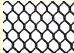
DNR900 FR 3/8" Knitted Polyester

Netting and nonporous liners are available in roll form with no selvage edge or in tarp configurations with a web border and grommets.