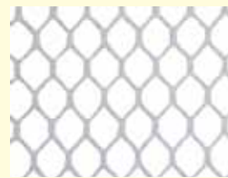
DNR800 FR 3/8" Knitted Polyester