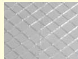
Spillex* 10 Mil Polyethylene